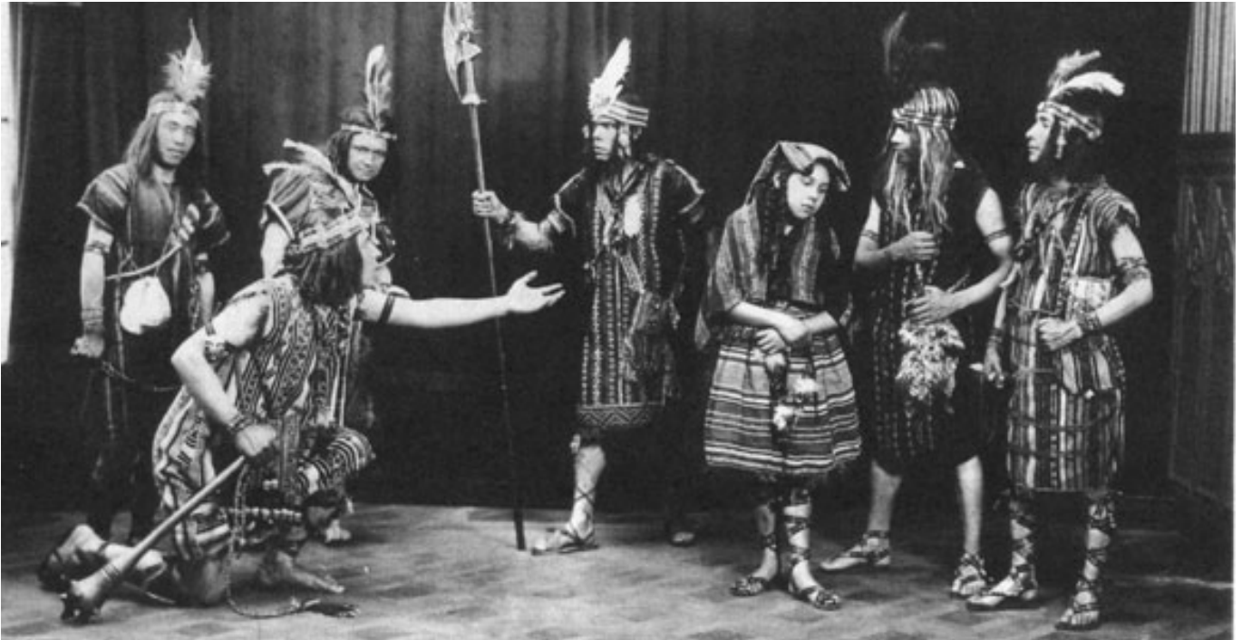
FIGUEROA AZNAR, "WHAT THE TRAVELLER DREAMED" (CUZCO, C.1920).