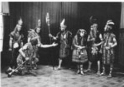
Figuroa Aznar, "what the Traveller dreamed" (Cuzco, c.1920).

Given this “framing” of indigenous people, technological advances that led to a fast rate of transculturation are marked by the archive visually by coding urban dwellers as mestizos and rural ones as campesinos and/or Indians. 10 For all practical purposes, then, the transformation Cuzco underwent while it was modernizing in the early part of the century rendered the Indian presence in the city impossible. Or “Indians” persisted as performance. Reminding us of indigenismo’s celebration of indigeneity, Andean forms of theater, music, and dance with “Incaic” themes dominated the cultural landscape of the period. The Inca tragedy Ollantay , performed to this day, gained prominence and theater troupes toured across Latin America. This context may help explain one tag Antuca attached which repeatedly confused me causing me to question her. It was usually attached to photographic subjects wearing traditional indigenous dress. Antuca had invariably labeled these “disfrazados” [“disguised”]. Sometimes this category was very clearly used to point to one of the many theatrical representations that accompanied and promoted the early indigenismo. But