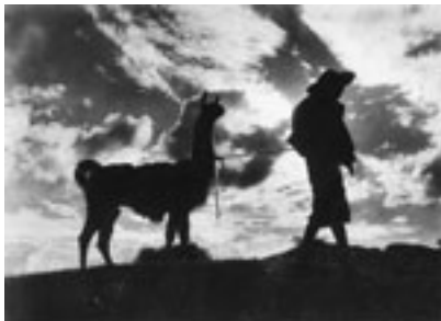
Martín Chambí, "Indian and llama" (1930).

But if we backtrack a bit, along with Poole, and follow a different line of inquiry, we note that the arrival of photography in the Andes actually coincided with the emergence of tourism and nationalist indigenism across the Americas. That is, almost one hundred years after independence, political, artistic, and social movements arose that argued for the inclusion and representation of indigenous peoples in national narratives. The "discovery" of Hiram Bingham of the ruins of Machu Picchu in 1911 is therefore doubly significant within the context of the emergence of a Cuzcoan indigenismo. Unremarkable in and of itself because these ruins had been known to locals, the "discovery" of Machu Picchu led to the naming of Cuzco as the "Archaeological Capital City of South America" in 1933, thanks to the propagandistic efforts of