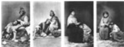
Lice-pickers, cartes de visite, Album "Types et coutûmes indiens du Pérou et de la Bolivie."

monumental silence of the archive. As they write, thanks to the Courret brothers, “we have inherited the image of mute faces of people of different races that confront us looking at the camera of the photographer” [“Hemos heredado la imagen de rostros mudos de distintas razas que nos enfrentan mirando la cámara del fotógrafo y que por lo tanto nos miran desde nuestro pasado] (Deustua 2009, 3). In the case of the photograph of the Giant of Paruro, the subject’s muteness is quite literal and visible. Yet in all three cases, despite the different contexts and institutional framing devices they find themselves in today, the implicit references to muteness remain the same. They mimic, undigested, the very language created by lettered indigenista intellectuals in the early part of the 20 th century, who viewed the indigenous population as a “powerful force” but “invariably mute.” As Jorge Coronado argues, this [inability or unwillingness to understand the other?] made “demands on the intellectuals that wish[ed] to represent it.” (Coronado 2009, 151). These “demands,” this wish “to represent”—and in fact speak for the other, of course, has been justly critiqued for its paternalism, but what is surprising is that, despite this critique, it continues unabated and unexamined persisting in much of the scholarship regarding photographic archives.