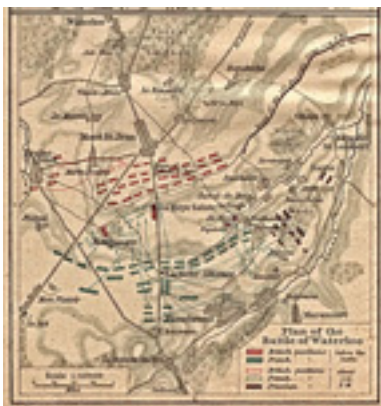
Waterloo Battle Map

This dizzying, mutually reinforcing set of scenarios is what globalization looks like. It is what Achille Mbembe has called the “entanglement” (2001: 14–16) typical of this period in which nations have been decolonized and yet are subject to neo-colonial control, while the former colonizers have come to grasp that the global empire described by Hardt and Negri has authority over them rather than vice-versa. In order to find our way through the entanglement we need to start at a specific point: as visualization was originally a military tactic, let’s begin with counterinsurgency. For the conservative historian Thomas Carlyle, writing in 1840 just after the aftermath of the emancipation of the enslaved in the British Empire, visibility was the attribute of the hero (Mirzoeff 2006). Carlyle appropriated the idea by which a general was held to visualize a battlefield that had become too large to be seen by any one person.