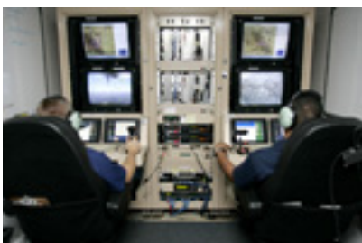
Unmanned Aerial Vehicle

In April 2010, The New York Times reported that UAVs launched at least 50 attacks in Pakistan last year resulting in at least 500 casualties. The UAV is emerging as the signature technology of the new crisis of visibility, even touted as environmentally friendly (relative to ground operations). On the one hand, it epitomizes what Derek Gregory has called the “visual economy” of the “American military imaginary” (2010: 68). At the same time, it is clearly a departure from conceiving counterinsurgency as “armed social work” (75). The operators of such attacks are not even in the same country as their targets, but instead work from trailers in Utah or Nevada via digital interface. Furthermore, the current results in Afghanistan and Pakistan are unclear even by counterinsurgency standards. In asymmetric warfare, how does one measure success? Recent military discussion, both official and unofficial, has raised this question in connection with the transformation of military life from a field-based set of activities into a permanently digital mission, not unlike the professional activities of a sales executive. In the eighteenth century, the newly invented lowest rank of officer, known (interestingly enough) as the subaltern, reported back to the general in person on the state of battle, thereby embodying visibility.